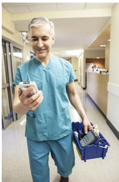
Mobile workflows are faster

These devices act as an adjunct or complement to existing workstation on wheels (WOWs) solutions, which would be used for heavier documentation activities that require a full keyboard. The combination of converged mobile devices, WOWs, and desktop systems can provide nurses and physicians with multiple entry points to the electronic medical record, offering the flexibility to use whichever device is most appropriate to the environment or situation.