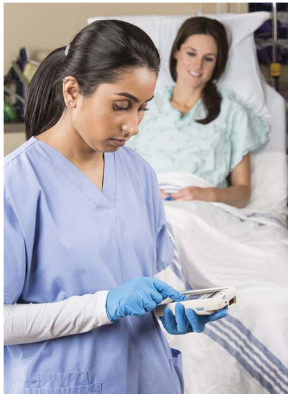
Texting the doctor from the bedside

Deploying mobile, flexible, and reliable IT tools to caregivers is a top priority for provider organizations that not only need to meet new regulatory and technology requirements, but want to do so efficiently. At Cedars-Sinai Hospital in California, for example, the combination of smartphones and a new software solution to help prioritize alarms resulted in faster response times for emergency conditions, and a 50 percent reduction in overhead pages. Laboratory values are received 10 minutes faster and nurses are able to spend more time at the bedsides of patients