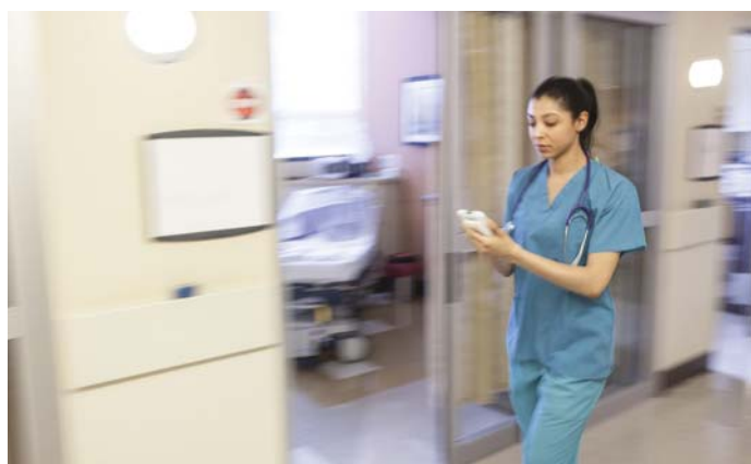
Smartphones allow faster response to telemetry alarms

The passage of the The Health Insurance Portability and Accountability Act (HIPAA), Health Information Technology for Economic and Clinical Health (HITECH) Act, and the Patient Protection and Affordable Care Act (PPACA, or ACA) have established new incentives to promote technology adoption, and created new regulations related to outcomes, patient safety, and documentation. In response, hospitals and other healthcare facilities have deployed a dizzying array of technology, from electronic medical record (EMR) systems and networked medical monitoring devices, to bar code scanners for medication administration at the bedside and hospital-provided mobile phones to improve team communication. While these efforts have provided improvements in patient safety and