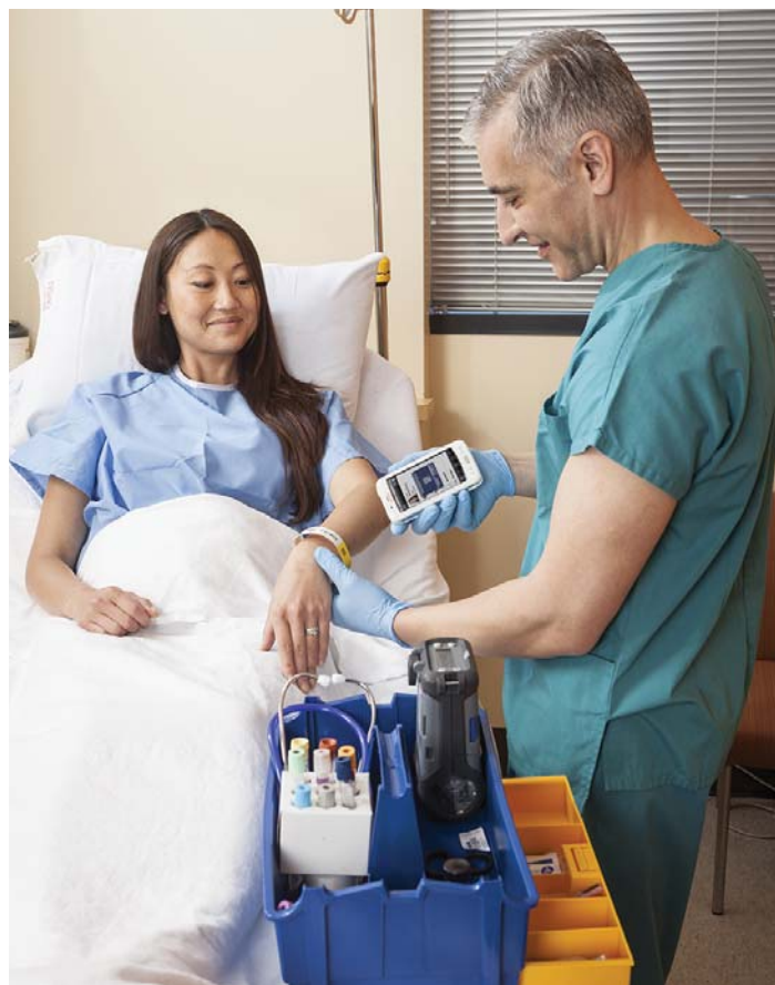
Positive patient ID with converged device (iPhone)

Operationally, these devices must be able to run a