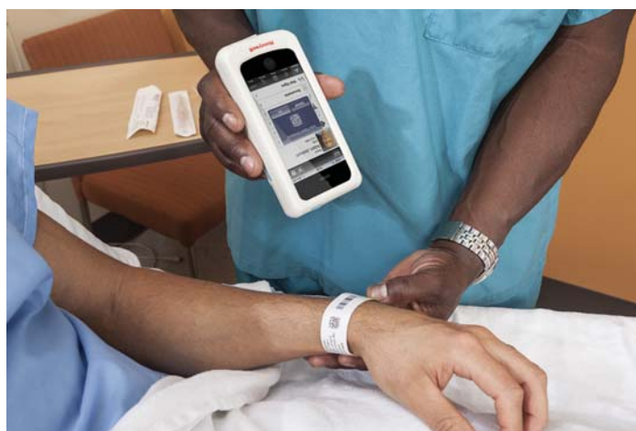
Using a converged device to scan patient wristbands

Consider that in many hospitals, simply asking a question of another staff member and receiving an answer may require a combination of walking the floor to search for a colleague, calls and call-backs, and overhead paging. According to a study by the Wood Johnson Foundation 1 , nurses waste as much as 60 minutes of each day tracking