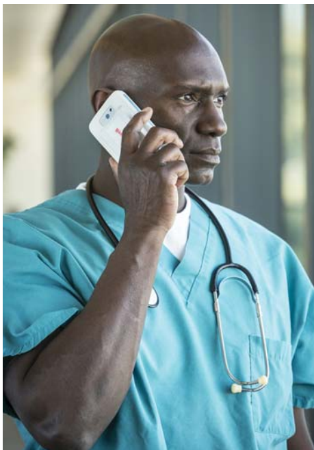
Voice calls between care team members

Regardless of whether the facility deploys a purpose-built device or iPhones equipped with scanning sleds, the benefits of deploying one mobile device that allows the nursing staff to interact with doctors, patients, other nurses, and a full suite of patient care and messaging applications can both improve patient care and staff efficiency, while simultaneously improving the overall work environment.