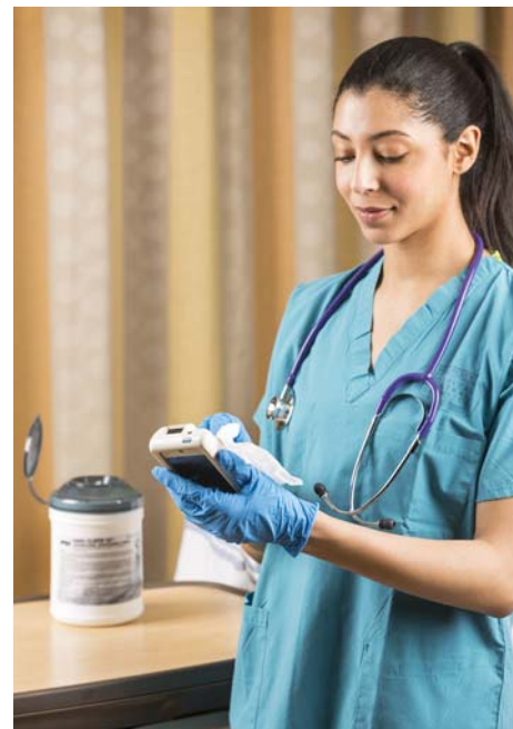
Disinfectant-ready devices are required

Regardless of whether the facility deploys a purpose-built device or iPhones equipped with scanning sleds, the benefits of deploying one mobile device that allows the nursing staff to interact with doctors, patients, other nurses, and a full suite of patient care and messaging applications can both improve patient care and staff efficiency, while simultaneously improving the overall work environment.